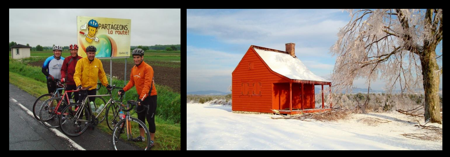
On September 25, 1775 the Redcoats captured Ethan Allen at Montreal and imprisoned him for three years in England. Warner and Stark blocked Burgoyne's final escape route at Saratoga October 1777.

Ethan Allen (Not Just a Furniture Company)—Leader of the Green Mountain Boys and instrumental in the attack on Fort Ticonderoga, he later became famous as a prison-of-war. When the British first captured him at Montreal in 1775, they treated him as a traitor and threw him into irons and conditions that were described at the time as "without regard to decency, humanity or the rules of war." General Washington himself complained to the British about Allen's treatment. The Redcoats upgraded Allen's status from traitor to prisoner-of-war, and took him out of irons, but this dilemma illustrated Britain's conflicting views towards the "Rebels."