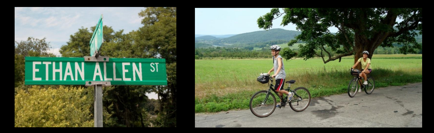
Salisbury produced 800 Cannon during the American Revolution; Ethan Allen owned part of the ironworks center.