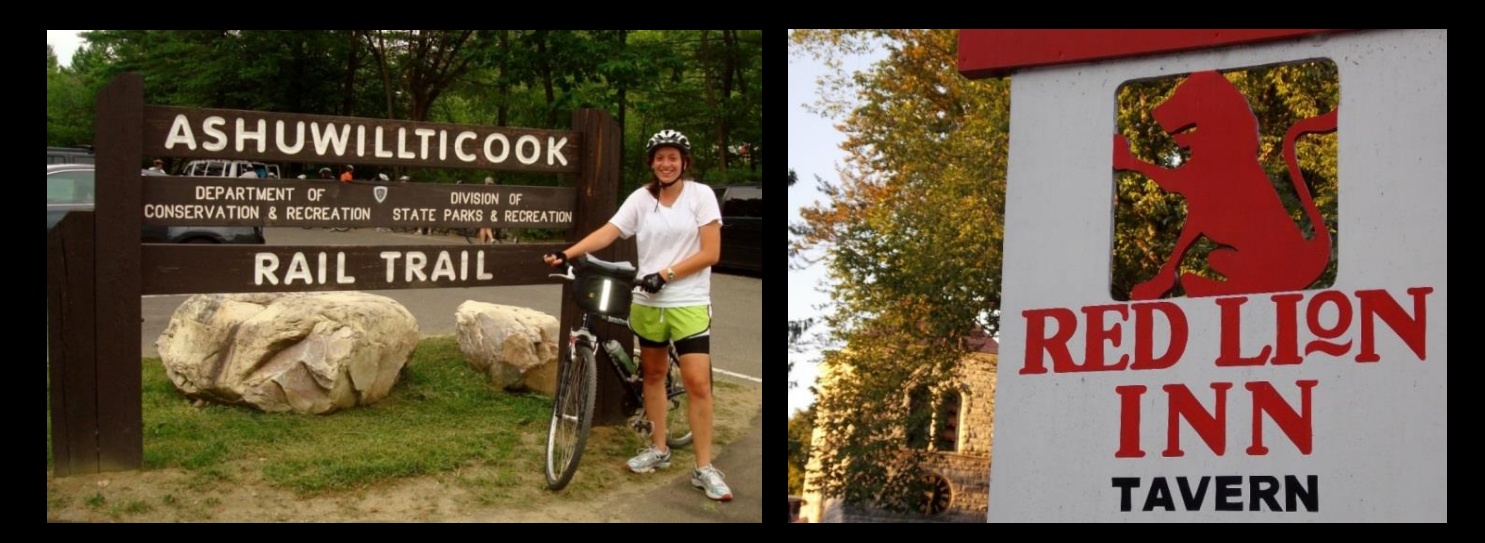
Cycling in Berkshire County Massachusetts from Sheffield to Williamstown, parallel to the route Connecticut and Massachusetts Militia marched to Bennington and then Ticonderoga.

The Allen family originated in Connecticut, but had bought land in present day Vermont, then called New Hampshire Land Grants, but New York felt it was under its jurisdiction and wanted them to pay a fee. The Allen brothers refused. So when the call came to invade New York and seize cannons and other munitions from Fort Ticonderoga, the Green Mountain Boys couldn't wait to attack the British fort in the New York colony, not just for the patriotic cause but also because of the hated New Yorkers.